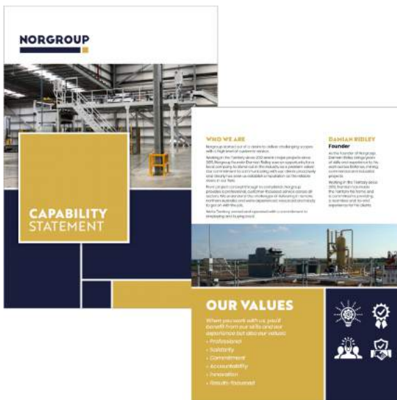
Norgroup Capability Statement