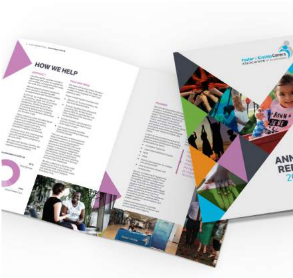
Foster and Kinship Carers Annual Report