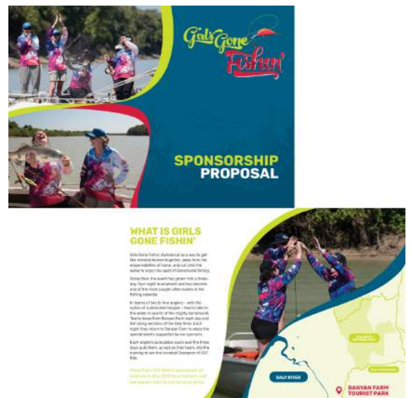
Girls Gone Fishin' Sponsorship Proposal