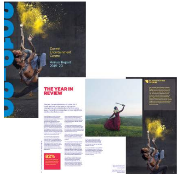
Darwin Entertainment Centre Annual Report