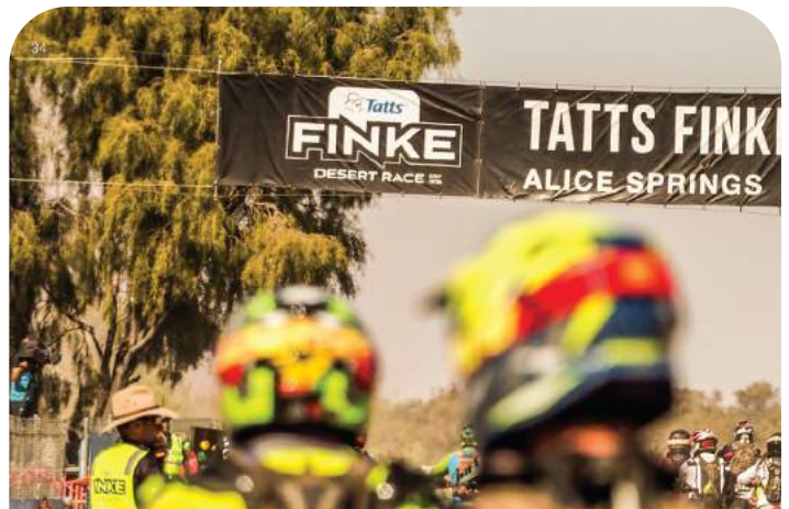
Finke Desert Race Safety Message Script

BUT PERHAPS THE MOST CRITICAL PART OF THE RACE IS A TEAM YOU DON'T EVEN THINK ABOUT. MEET EVENT COMMAND.