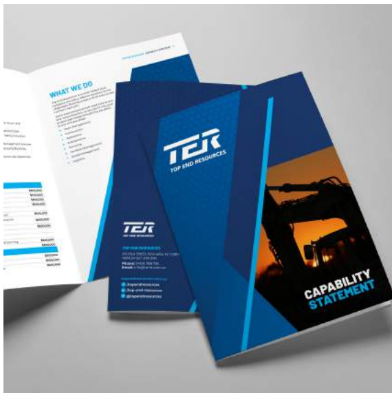
Top End Resources Capability Statement