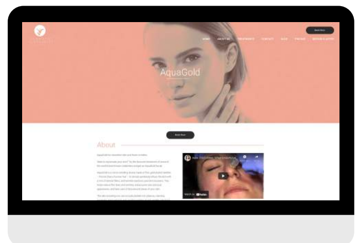
Cosmetic Injectables Australia SEO Copy