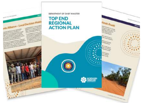
Top End Regional Action Plan