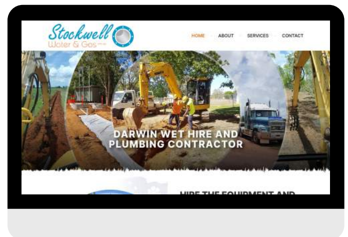
Stockwell Water and Gas SEO Website Copy