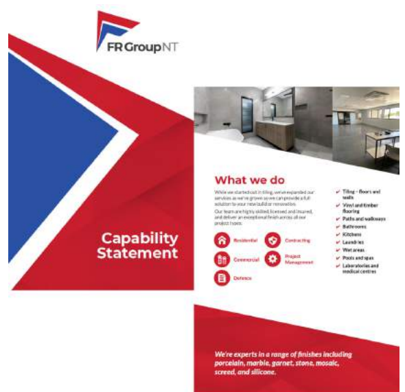
FR Group Capability Statement