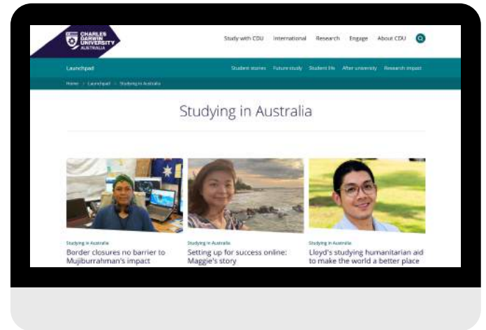
CDU Student Stories - blog articles