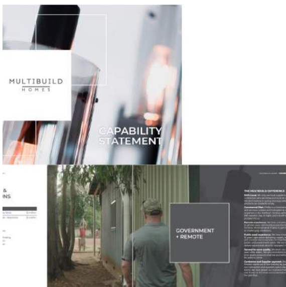
Multibuild Homes Capability Statement