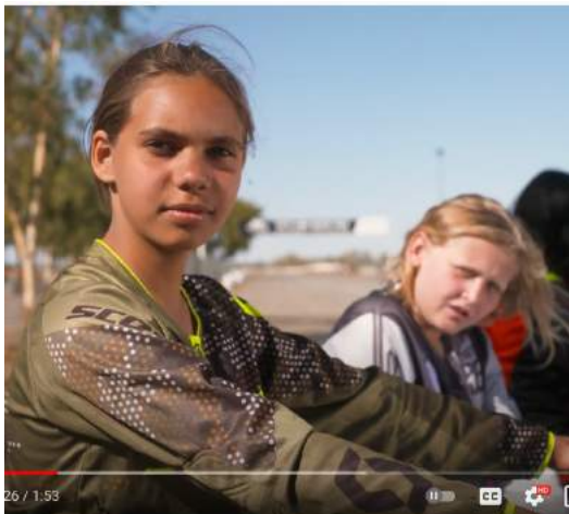
Quad Squad Safety Message