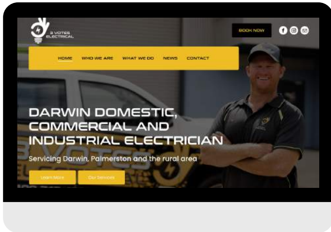
Three Votes Electrical SEO Website Copy